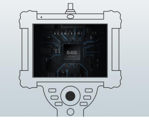
64G HDD storage