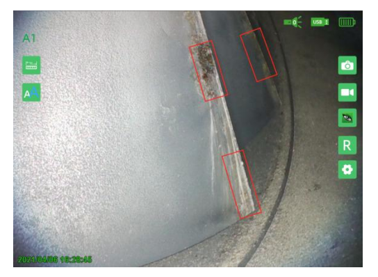
Defect automatic identification