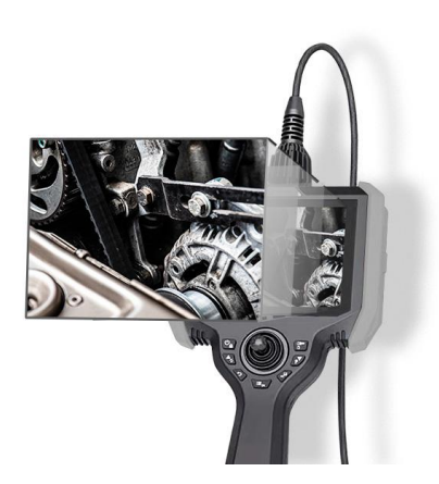
5 inch large screen, more convenient to watch