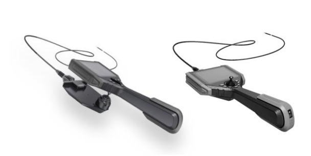
Quick pipeline replacement