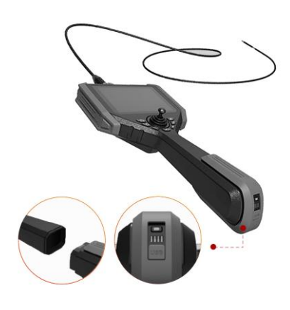
Combined battery, easy to disassemble