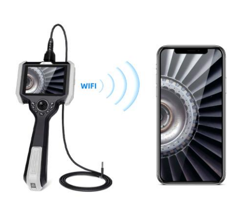
WIFI Wireless Transmission (optional)